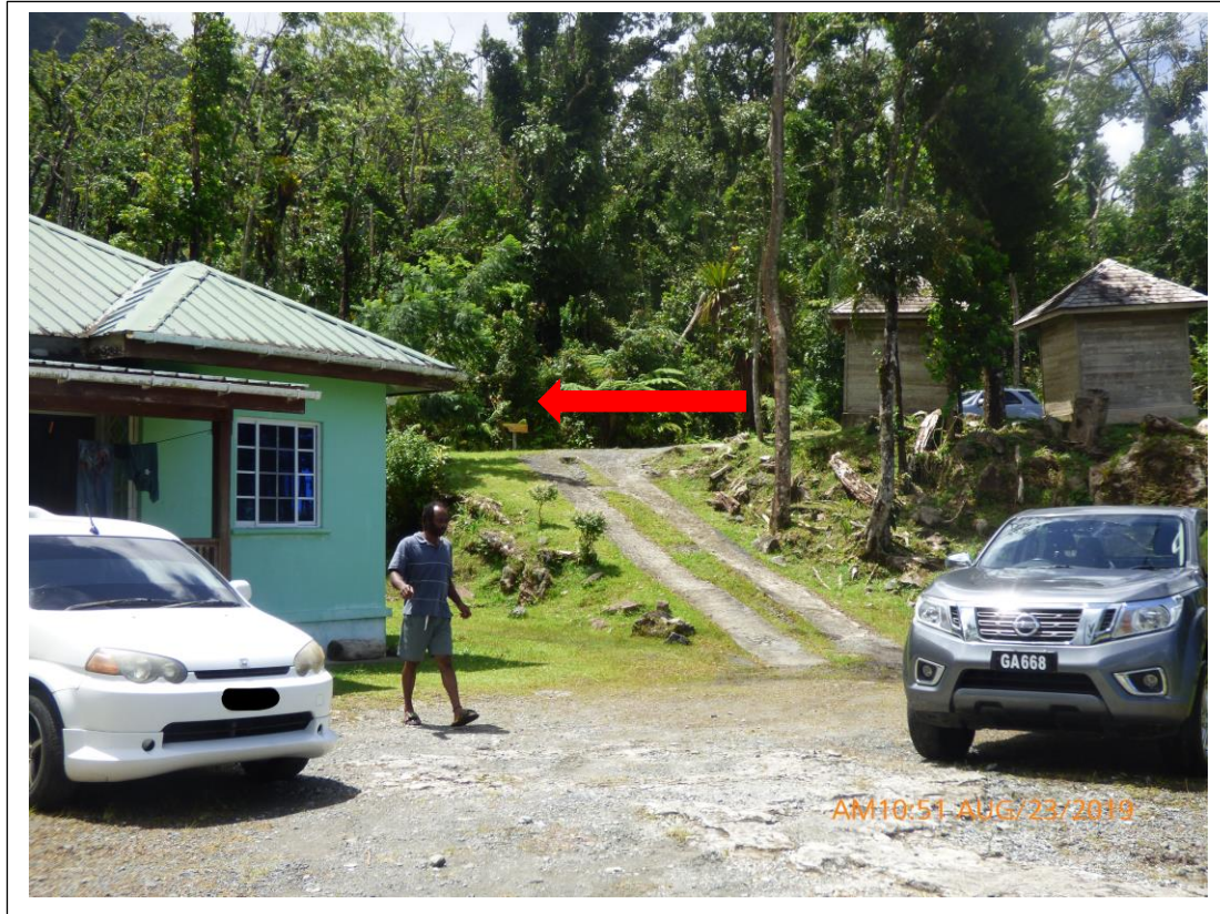
Photo: View of site from trail point