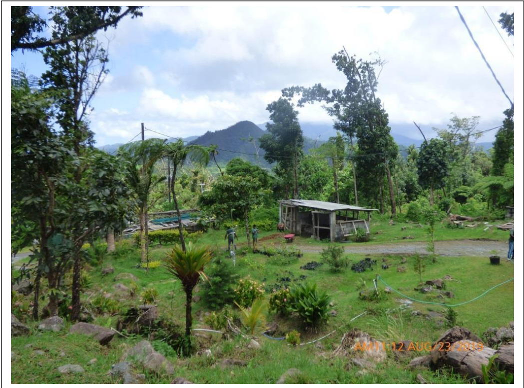
Photo: Propagation Building to be rehabilitated and upgraded