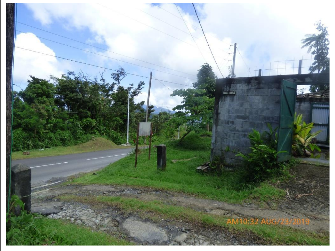
Photo: Existing access road on site to be improved